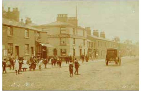
London Road, showing the Greyhound Inn, c.1905.

These are typical terraced houses, seen all across the region in industrial towns. It's difficult to work out exactly where number 4 was. It seems most likely that the houses were renumbered and it is now actually number 5.