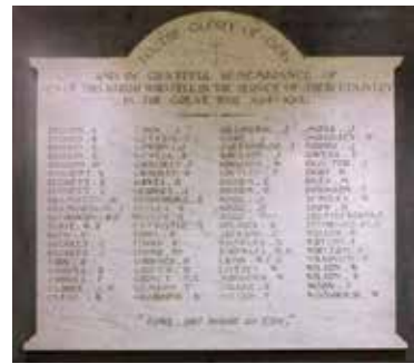
The memorial of St. Mary's Church, now in the Lancashire Conservation Studios.

Sir Giles Gilbert Scott also designed the Roll of Honour, which is situated in the main stairwell of the Harris. From 1916 to the unveiling of the Roll of Honour in 1927, families could complete a form if they wanted the name of their loved ones to be included.