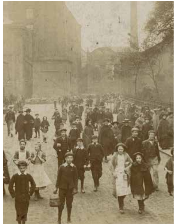
Staff leaving one of the local mills, c.1900.