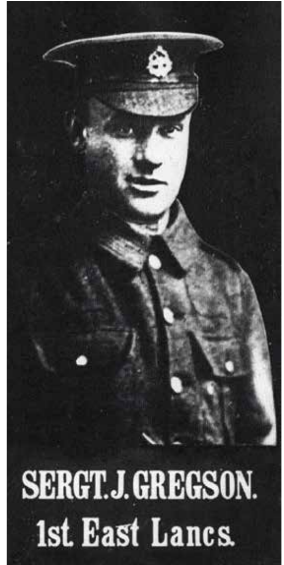
John Gregson, a still from the Will Onda Roll of Honour film, 1915.

The three trails cover different parts of Preston and have different starting points. The start point on the next page tells you the address that this story begins. Please refer to the map at the back of this leaflet to see the location of this address.