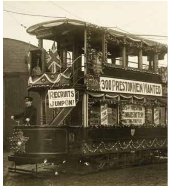
A local tram dressed to recruit soldiers for the war effort, 1915. Reproduced from documents held at Lancashire Archives, Bow Lane, Preston.