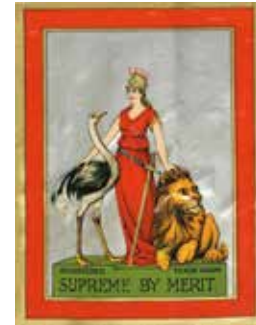
One of the Horrockses trademarks.